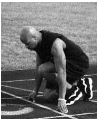
READY Position: Place the lead leg about 4 to 6 inches back from the starting line.

Those first three steps are all power. These steps perpetuates everything that follows.