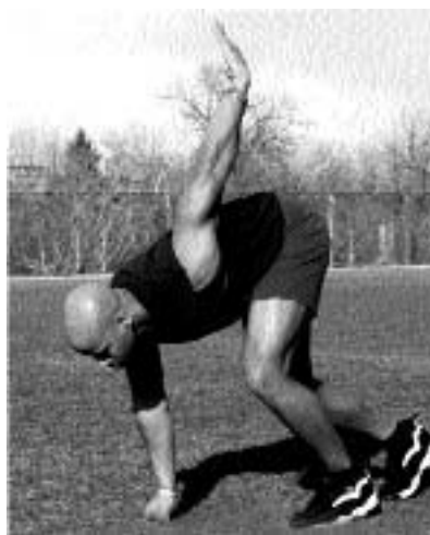
SET Position: Raise the butt higher than the shoulders. Push your arm back as far as possible. Lean as far forward over the line as you can without falling over.

ON GO, THE RAISED ARM SHOULD PUNCH FORWARD AND PROPEL YOU OUT OF THE STANCE.